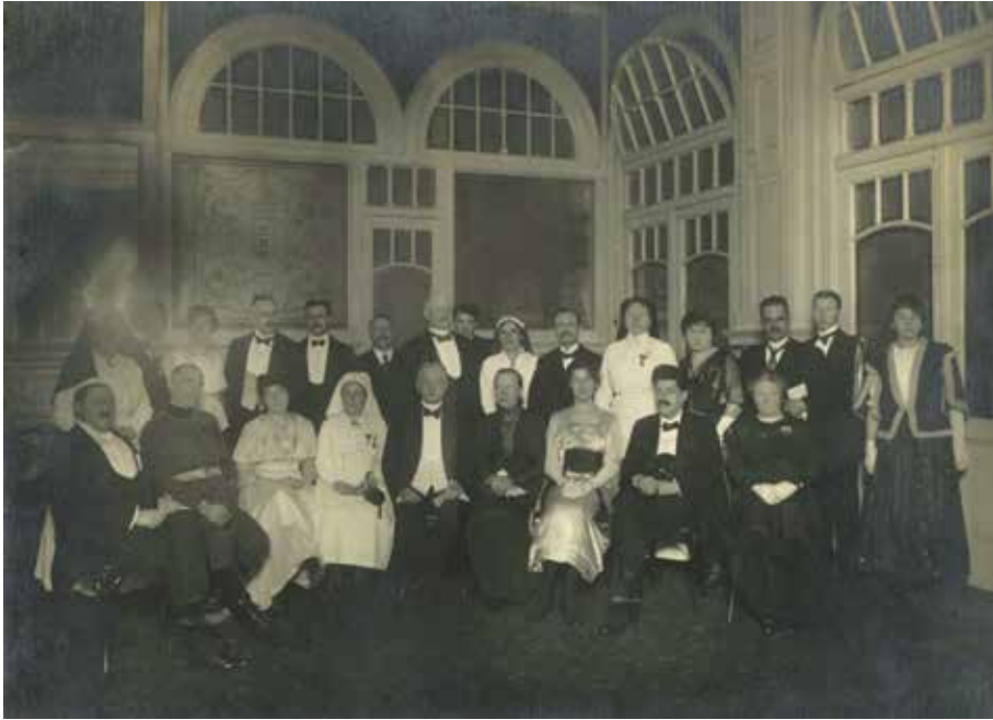
Picture 7: meeting of the committee for the benefit of Serbian prisoners of war, Amsterdam, 23 rd February 1919

From February, the transit of prisoners of war via the Netherlands was gradually phased out. The total number of Serbian prisoners of war who arrived in the Netherlands between November and February was 4,316. As we saw, some of these died, primarily of the Spanish flu. Of the remaining Serbs, 1,902 were repatriated via Vlissingen, the others via Rotterdam. 74