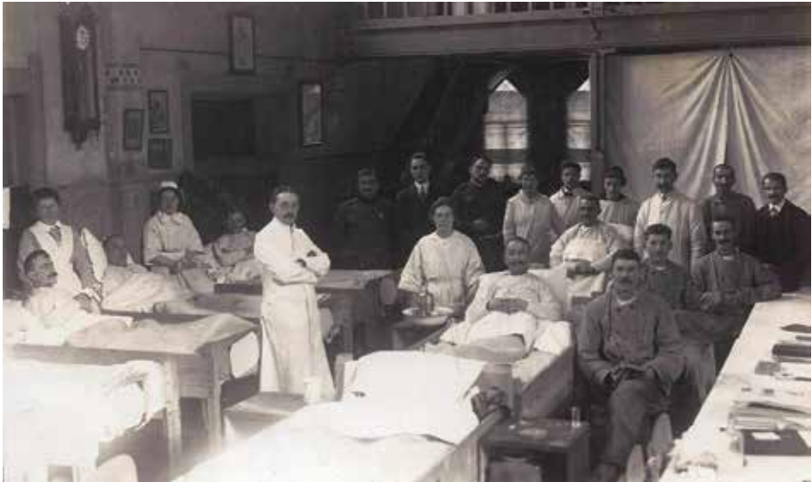
Picture 6: Serbian soldiers and staff at the Rotterdam auxiliary hospital, 5 th February 1919