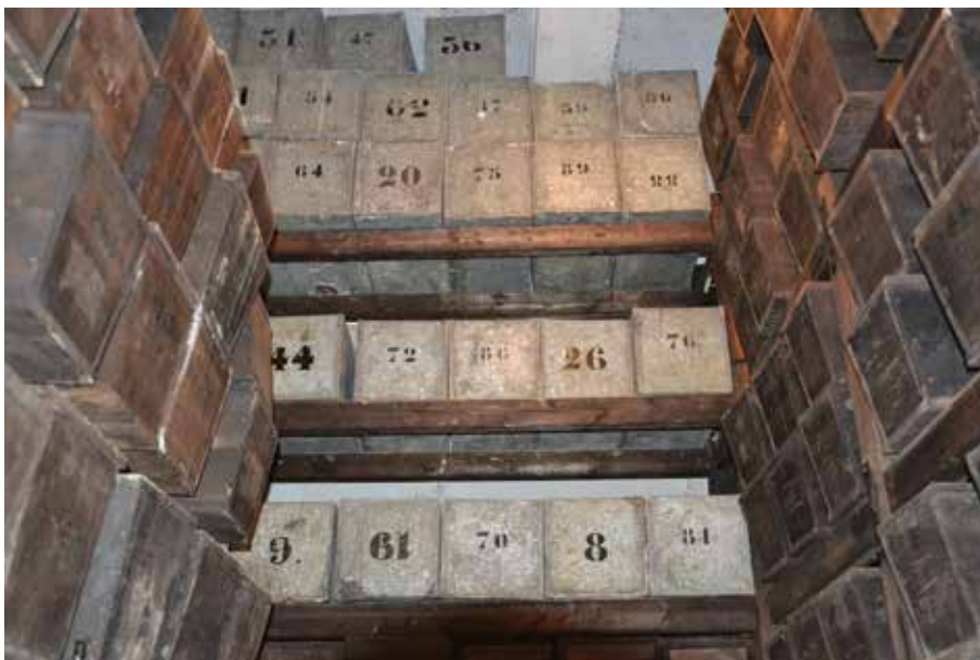
Picture 11: metal ossuaries in the crypt of the mausoleum, 28 th June 2014