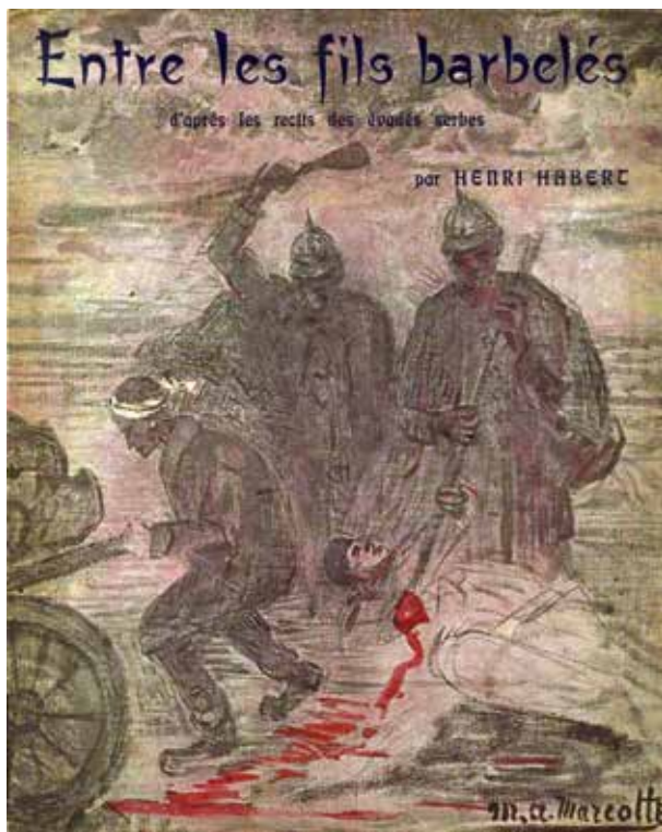
Picture 2: The cover of Henri Habert's brochure "Between the barbed wire" for the French edition.

“I managed to flee into the mountains, but the Austrians discovered me and took me with them. They brought me to Heinrichsgrün. In the camp there were 25 to 30,000 men, amongst them 5-600 of our officers. Afterwards they took me to Soltau; then, 15 days later, to Langenmoor, and from there to the camp near Bühnerbach where, I worked for 2 ½ months