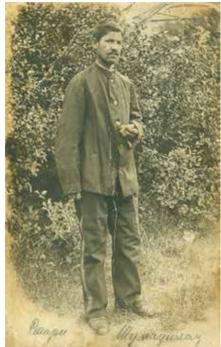
Picture 4: Picture taken on 15 th or 22 nd July 1917 in a prisoner-of-war camp, possibly Soltau.