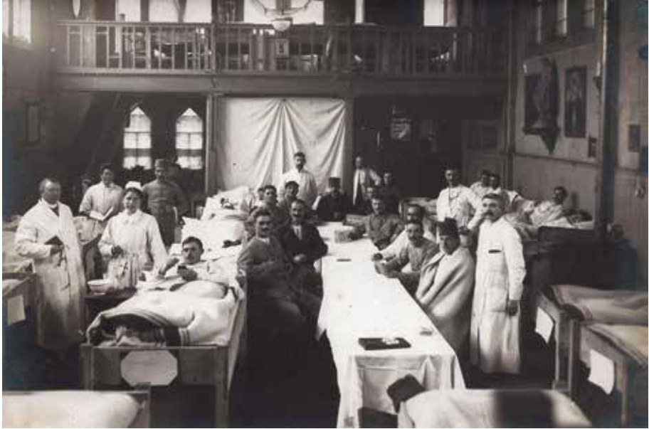
Picture 8: Serbian soldiers and staff at the Rotterdam auxiliary hospital, 5 th February 1919

ceremony. Thus, the neutral Netherlands had the opportunity to experience more closely the characteristics and virtues of the Serbian soldier and his deeply-developed homeland duty awareness, as well as his unconditional readiness.” 75